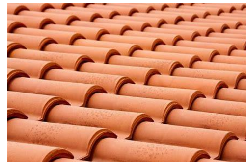
CLAY ROOF TILES