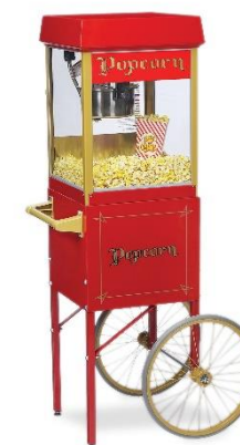
POP CORN MACHINES