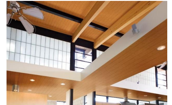
LAMINATED CEILING PANELLING