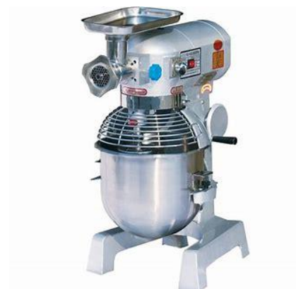
COMMERCIAL KITCHEN EQUIPMENT