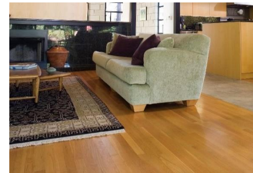
LAMINATED WOOD FLOORING