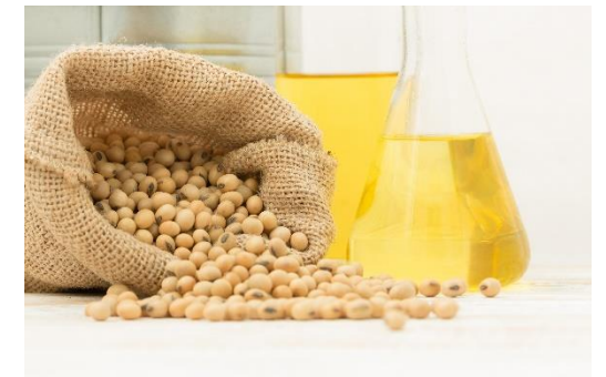
SOYA BEAN OIL