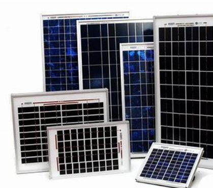
SOLAR POWER SYSTEMS