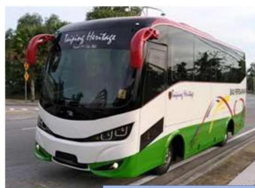
ALPHA M8 (RHS & LHS)

SQUARE Group has access to market and sell new assembled buses ideal for city manoeuvring. The Alpha M8 is a 28 seater capacity bus that offers comfort in intra-city or inter city travel. It is air-conditioned and offers a rear luggage compartment (approx. 2800 litres).