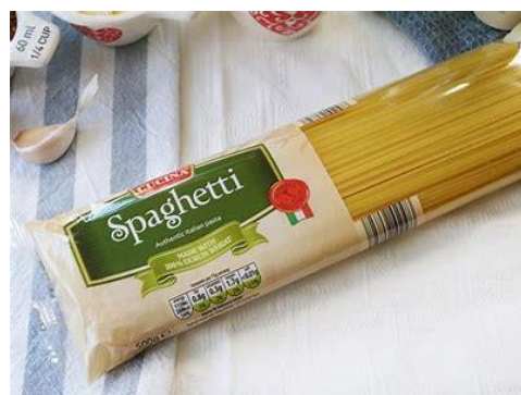
SPAGHETTI & PASTA