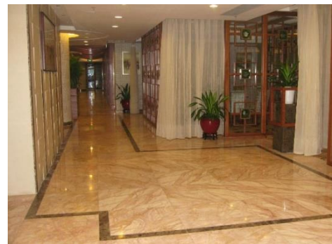
MARBLE, GRANITE AND PORCELINE FLOORING